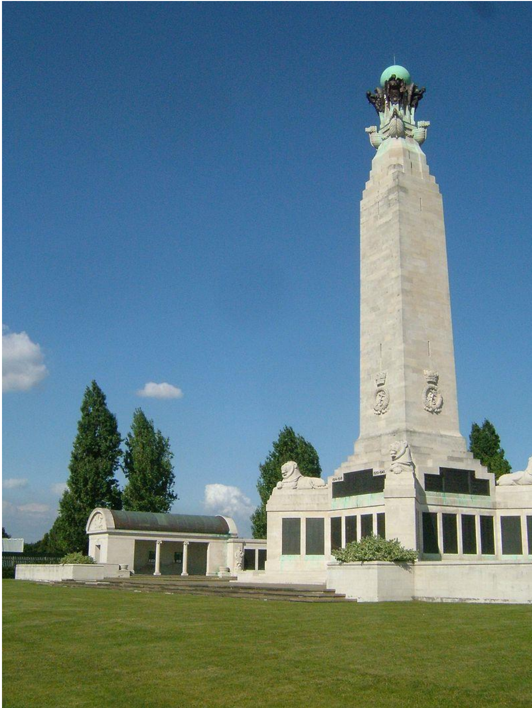
Chatham Naval Memorial

The Chatham Naval Memorial was unveiled by The Prince of Wales, the future Edward VIII, on 26 April 1924.