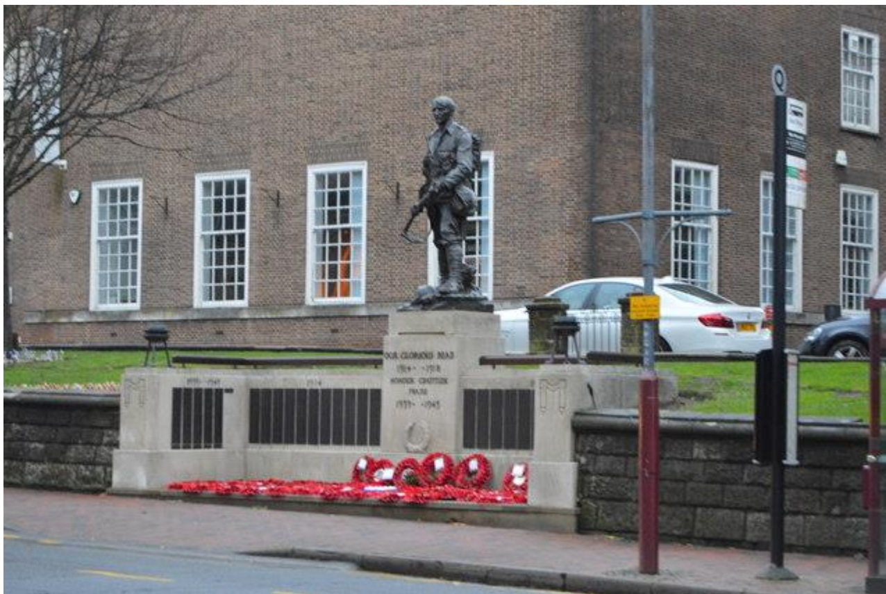
Tunbridge Wells War Memorial